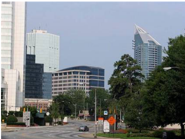
Atlanta, Georgia site of 2010 National AALAS Meeting