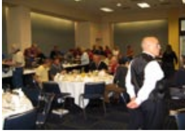
ATA Breakfast 2007